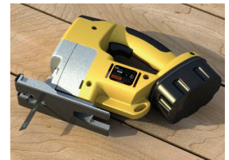
Using PhotoWorks, you can create powerful photorealistic effects using materials, indirect illumination, scenes, environments, and shadows. Image above courtesy of UAMZ